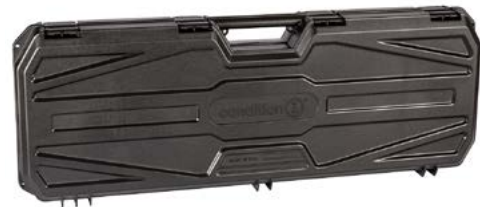
42" ECO #2300

INTERIOR: 16.8" X 10.10" X 3.73" EXTERIOR: 17" X 12.97" X 4.13"