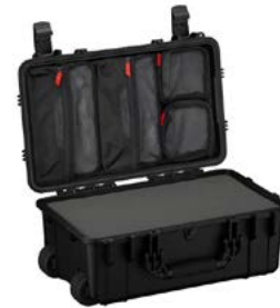
LID ORGANIZATION SYSTEM