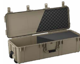
EMPTY OR PLUCKABLE FOAM

Whether you want an empty case, pluckable foam, padded dividers, pre-cut foam for your firearms or a lid organizer, we've got you covered.