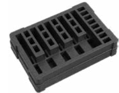
PRE-CUT FIREARM FOAM