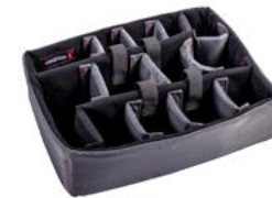
HEAVY DUTY PADDED DIVIDERS