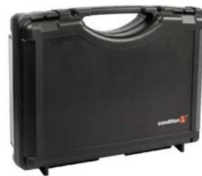
17" ECO #1764

INTERIOR: 13.8" X 7.75" X 3.17" EXTERIOR: 14" X 10.32" X 3.57"